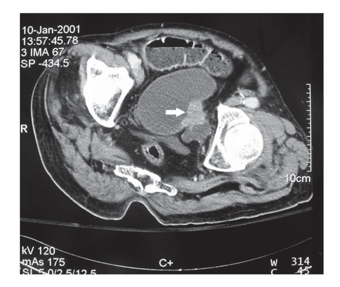
Fig. 2. CT scan of the pelvis: Bladder mass (arrow) with extension into the perivesicular area

Considering the diagnosis to be a descending colon carcinoma with bladder metastasis, we performed a palliative secondary stage operation involving en bloc resection of the colonic tumor and closure of colostomy and biopsy of the perivesicular tissue. There was a definite gap between the colon mass and blad-