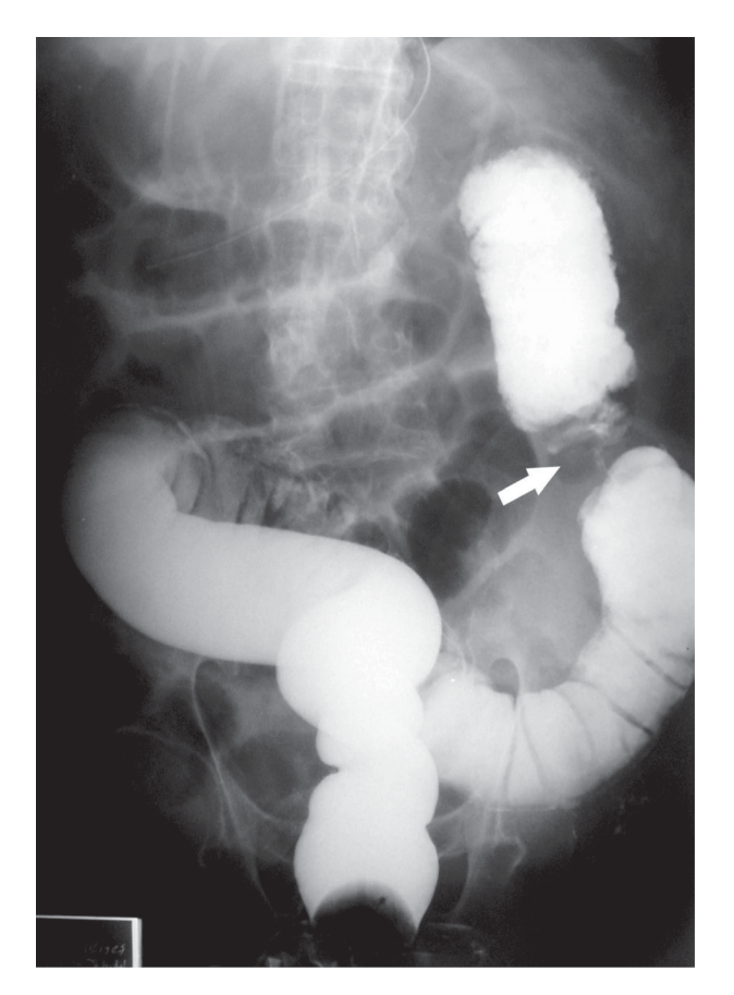
Fig. 1. Barium enema examination: Annular carcinoma (arrow) in the descending colon, with obstruction